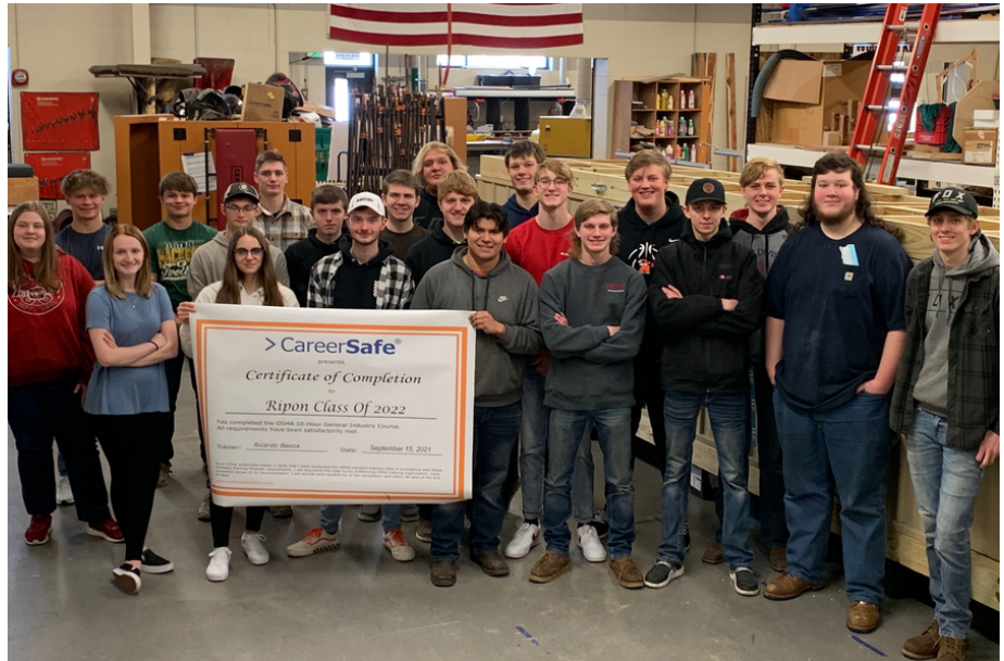
Congratulations to the RHS Tech Ed students who completed their 10-hour, independent, on-line course to become OSHA certified. Having this credential is great for future employment.